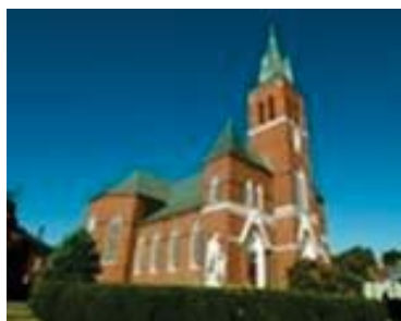
St. Joseph Church 2 School St. Amesbury, MA 01913

Marriage: Arrangements should be made by calling the parish office at least one (1) year in advance for marriage preparations and desired date.