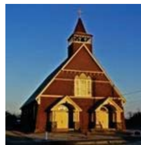
Star of the Sea Beach Chapel Memorial Day thru Columbus Day 141 North End Blvd. Salisbury, MA 01952