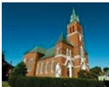
St. Joseph Church 2 School St. Amesbury, MA 01913

Marriage: Arrangements should be made by calling the parish office at least one (1) year in advance for marriage preparations and desired date.