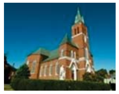
St. Joseph Church 2 School St. Amesbury, MA 01913

Marriage: Arrangements should be made by calling the parish office at least one (1) year in advance for marriage preparations and desired date.